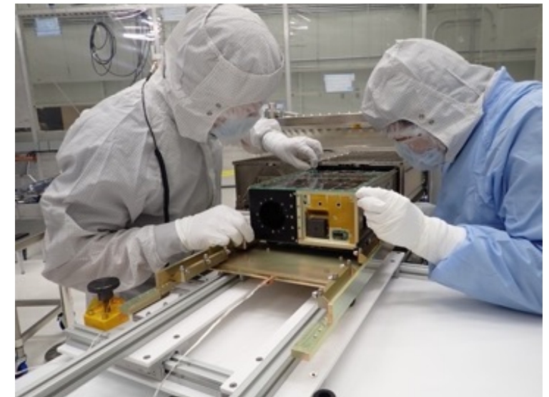
Engineers inserted CuPID into its deployer for flight. The black circular hole on the left is the X-ray telescope aperture